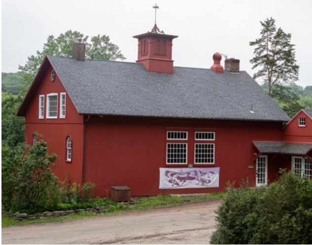
Bent of the River